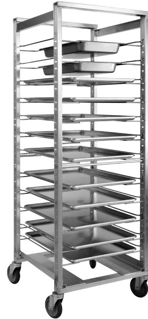
207-UA-13A (Pans not included)